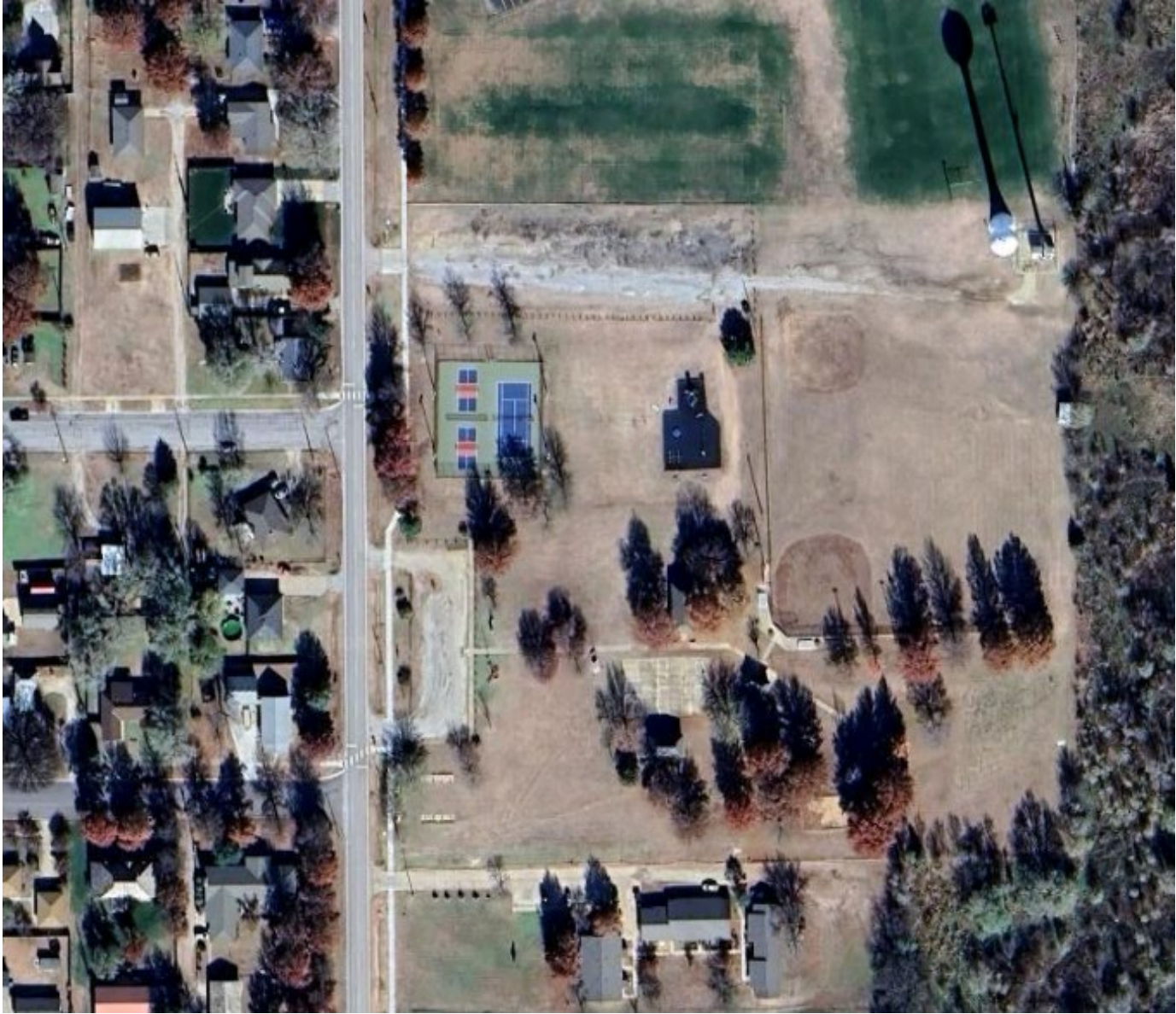
Exhibit A – Conceptual Plan For Reference Only