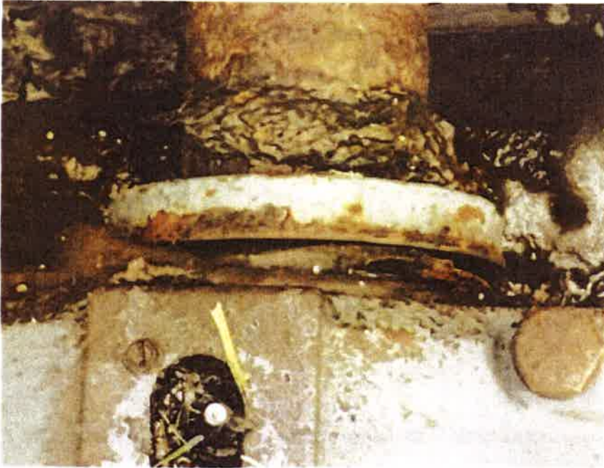
Inside bearing before removing, you can see where it is starting to fail.